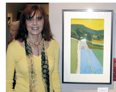
Second Place, Pencil, Colored pencil Ink, Charcoal, Pastel: Bev Sinclair Thordarson, "Road Test"