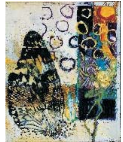
Wings Encaustic, Anderegg