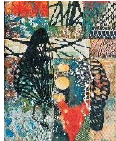
Joyous Echo, Claire-Lise Matthey Anderegg

Esoterica: For many artists, particularly the overly thoughtful and imaginative ones, self-sabotage can be a big boo-boo. Procrastination, avoidance activity and general lying around are some of the symptoms. If you look at the big picture, you may see yourself as a minor player, but it's also possible to see and hold dear the sacred value of each individual's life and times, yours in particular. With this view, simply making a contribution lets work-effort seem worthwhile and even inevitable.