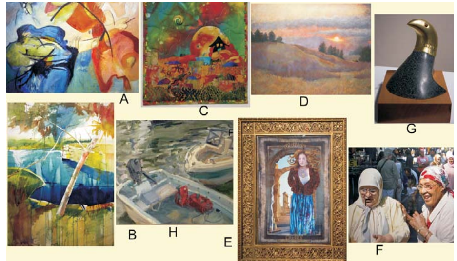
All First Place Winners in FAA Show (See Page 6 for categories.)

See Best of Show on Cover. More coming soon on Website.