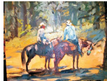
ELIN PENDLETON APRIL DEMO